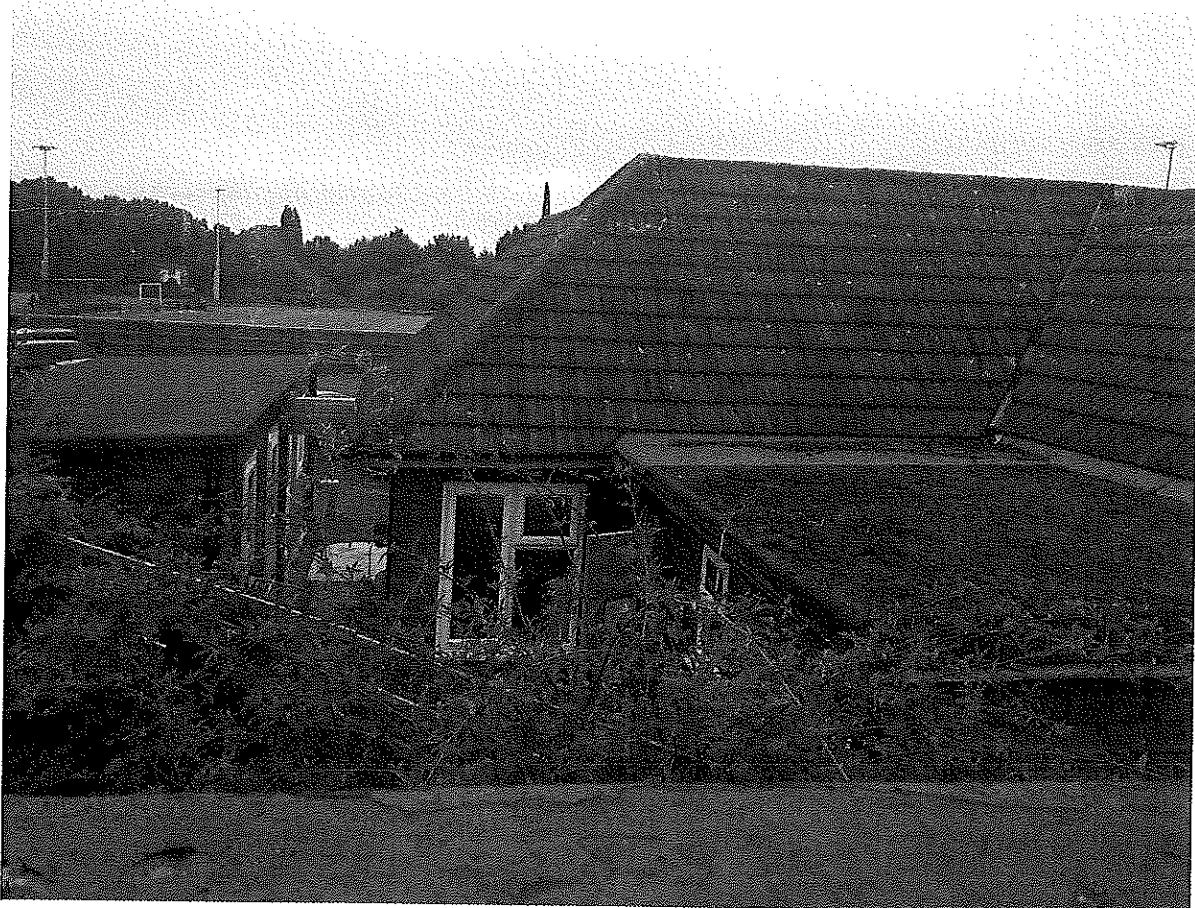
Picture 1. The view from the bedroom -

The distance between our house and the clubhouse is appx. 3m. Our bedroom, the kid's bedrooms and the showers are facing the clubhouse. We constantly suffer from loud noise and lack of privacy (see below picture 1). The rooms are very close and exposed to the clubhouse entrance, players go in and out of the clubhouse regularly. We are unable the leave the windows open before, during and after games – roughly 4 hours for each game. We also need to close the shutters.